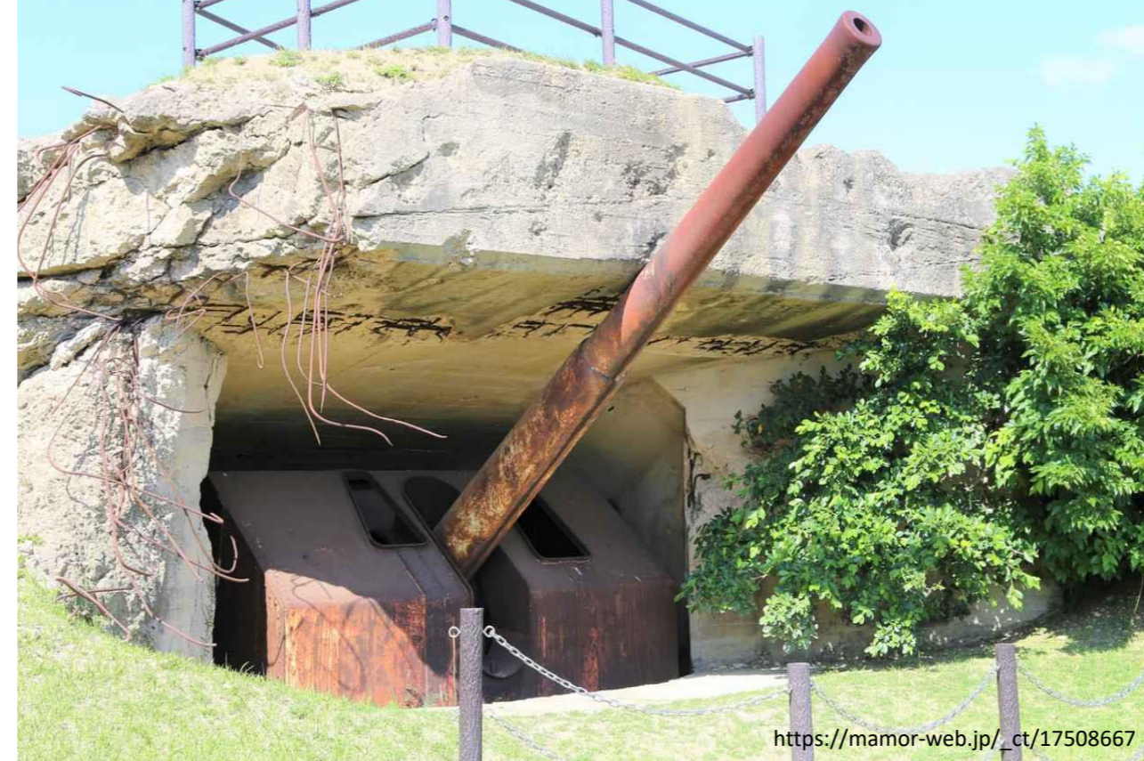
Military Heritage of Okinawa

Japan has experienced several wars in its history and has heritages that tell of the tragic events of World War II in particular. There are air-raid shelters and bunkers that were