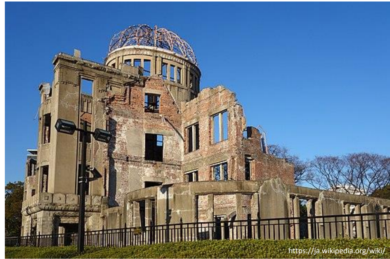
A-bomb Dome, Hiroshima