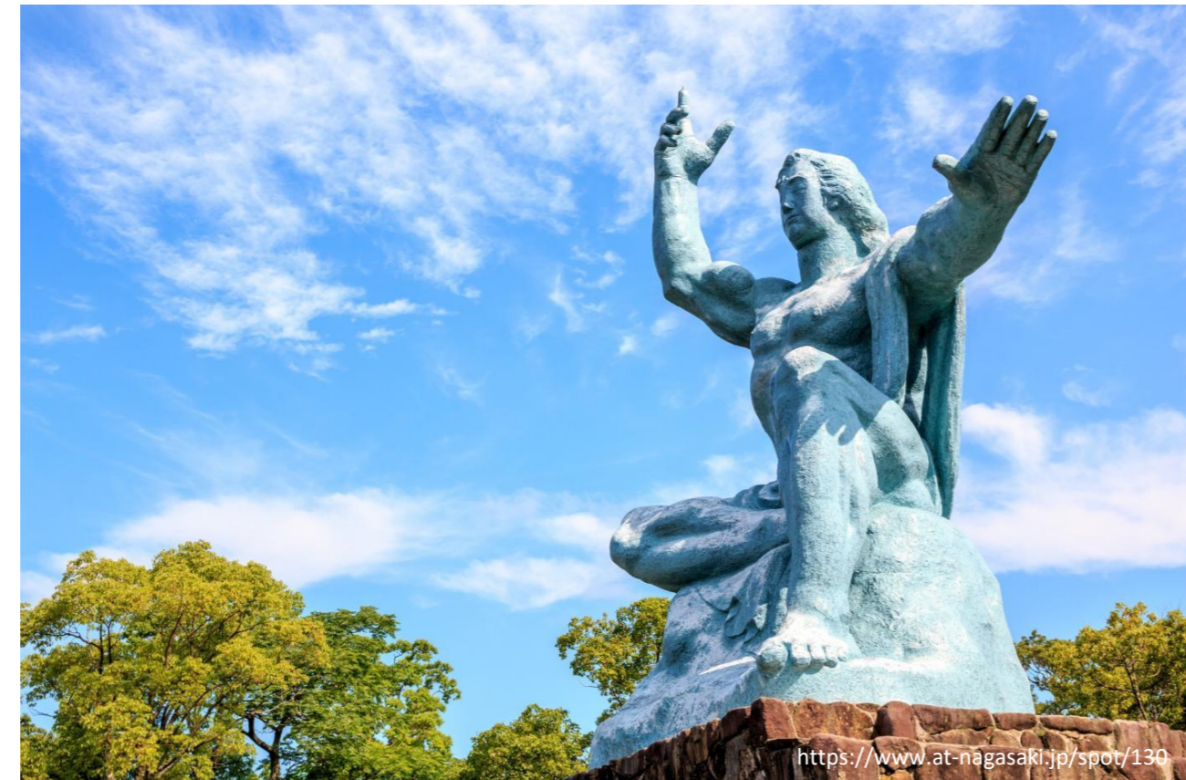
Peace Memorial Elephant of Nagasaki